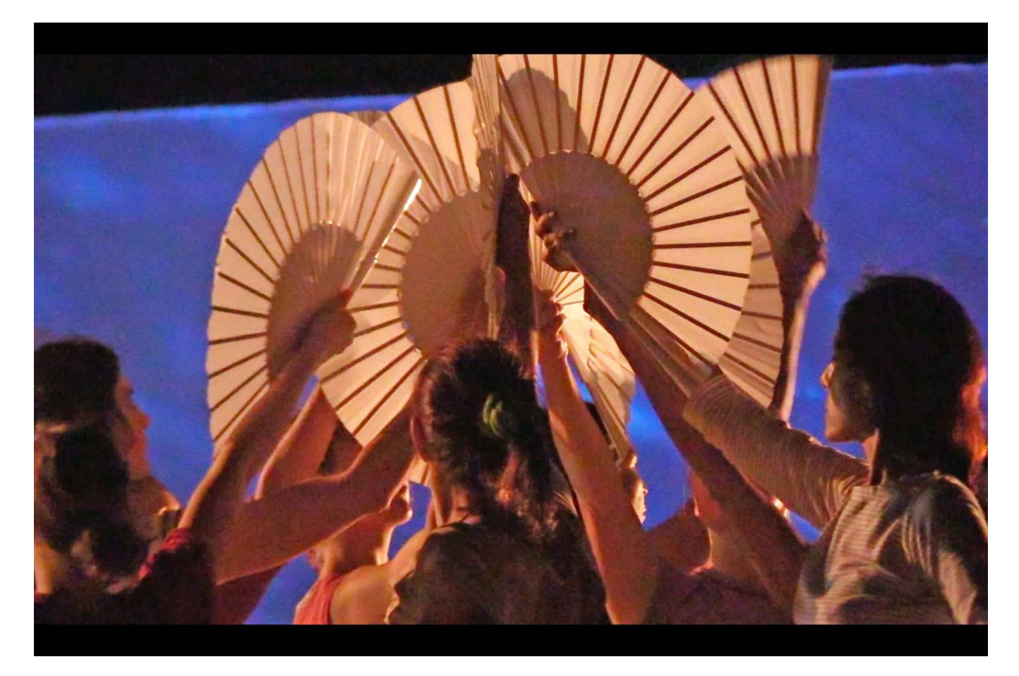
Dance performance during Auroville's 50<sup>th</sup> Anniversary festivities