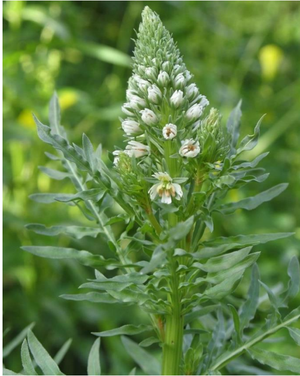
Botanical name: Roseda odorata Spiritual significance: Benevolence Makes life fragrant without attracting attention.