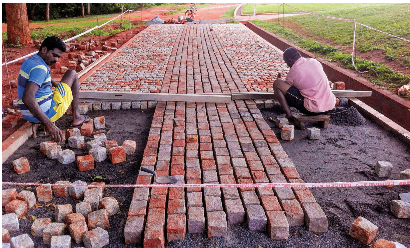
Masons laying granite cobblestones on a first portion of the Oval Road which surrounds the Matrimandir gardens.

One can easily imagine the generations to come who will stroll along this narrow road viewing the Matrimandir on one side and, on the other, the water body which is to surround the whole of this island. There will be greenery and benches, places to be quiet and to contemplate. There will be trees here and there to offer shade while one soaks in the beauty and serenity of the Matrimandir gardens. It is delightful to imagine the future beauty of this walkway.