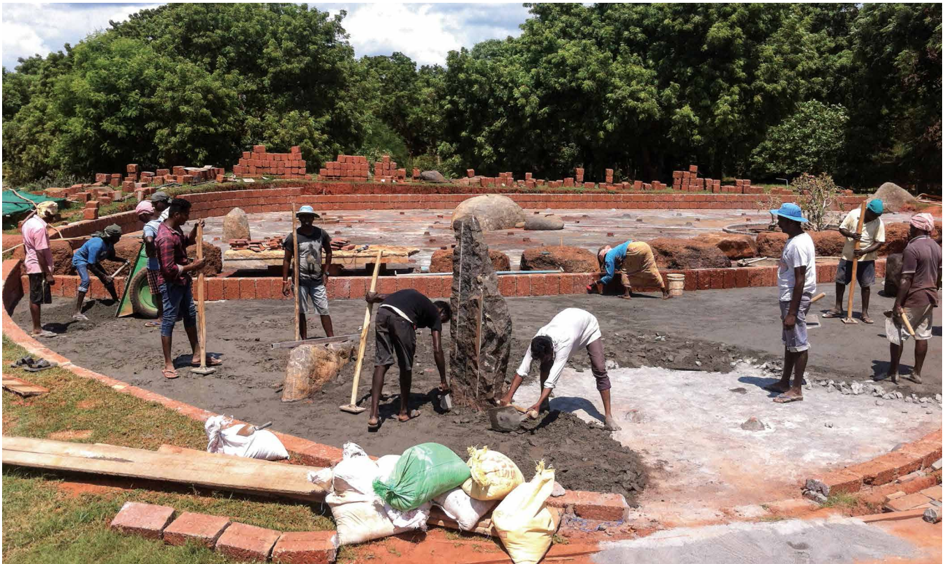
Creating the base layer for the "rock garden" in the Garden of the Unexpected on October 10th 2019.

A bird bath has been carved from a local granite boulder. Bird baths are a wonderful attractor for the many species of birds that populate the forests of Auroville. This section of the gardens has also been planted with a group of "butterfly trees" ( Caesalpinia coriaria ) with the Mother's significance: "Intuitive Knowledge". When flowering, the trees are known to attract large numbers of butterflies. This will be a delight for the children exploring this part of the garden.