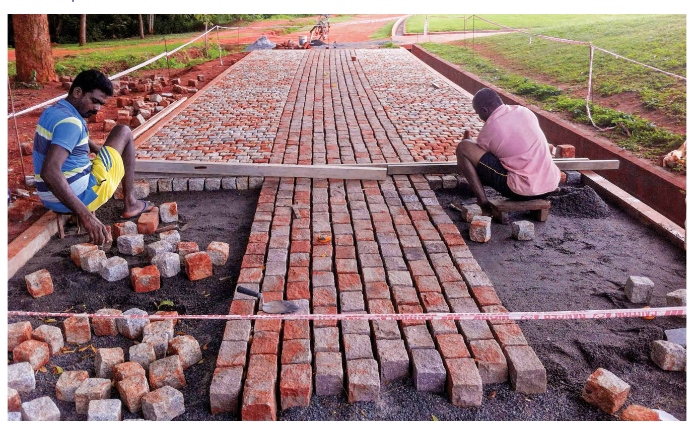
Masons laying granite cobblestones on a first portion of the Oval Road which surrounds the Matrimandir gardens.

One can easily imagine the generations to come who will stroll along this narrow road viewing the Matrimandir on one side and, on the other, the water body which is to surround the whole of this island. There will be greenery and benches, places to be quiet and to contemplate. There will be trees here and there to offer shade while one soaks in the beauty and serenity of the Matrimandir gardens. It is delightful to imagine the future beauty of this walkway.