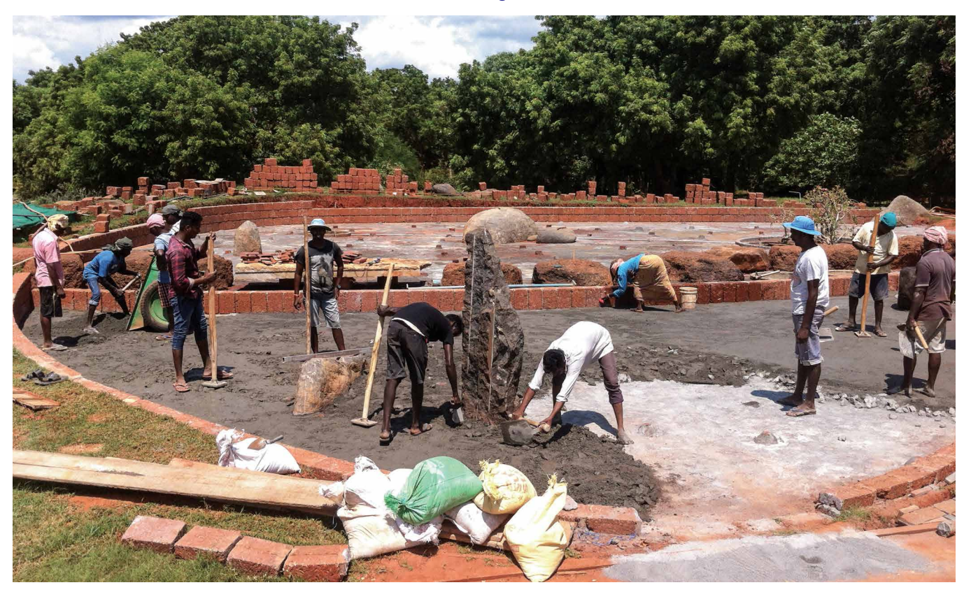
Creating the base layer for the "rock garden" in the Garden of the Unexpected on October 10th 2019.

A bird bath has been carved from a local granite boulder. Bird baths are a wonderful attractor for the many species of birds that populate the forests of Auroville. This section of the gardens has also been planted with a group of "butterfly trees" (Caesalpinia coriaria) with the Mother's significance: "Intuitive Knowledge". When flowering, the trees are known to attract large numbers of butterflies. This will be a delight for the children exploring this part of the garden.