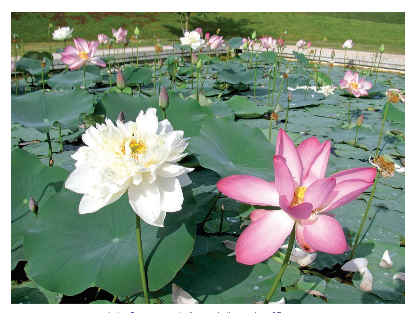
Lotus flowers open to the sun in the garden of Progress