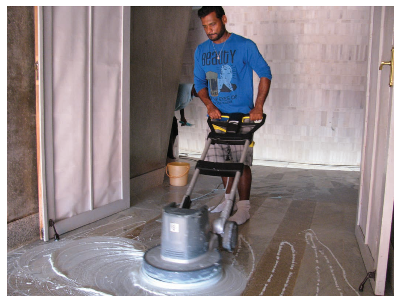
Polishing the marble floors was one of the many maintenance works undertaken inside Matrimandir during the month of June

'reversed reality', for example, a place where one can feel the sky on the ground and the ground in the sky.