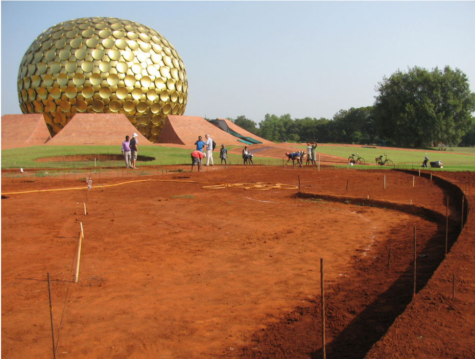
Contouring Auroville's red earth in the garden of Progress

of the outer slope of the Amphitheater, a Green Room is being built, - a space where performers can prepare themselves, before coming out via a passage created through the Amphitheater steps to reach the rounded stage of the Amphitheater just adjacent to Auroville's marble inaugural Urn. Musicians and dancers, - performers from many other disciplines too, will continue the tradition of giving here their best and most inspiring artistic offerings over the years to come.