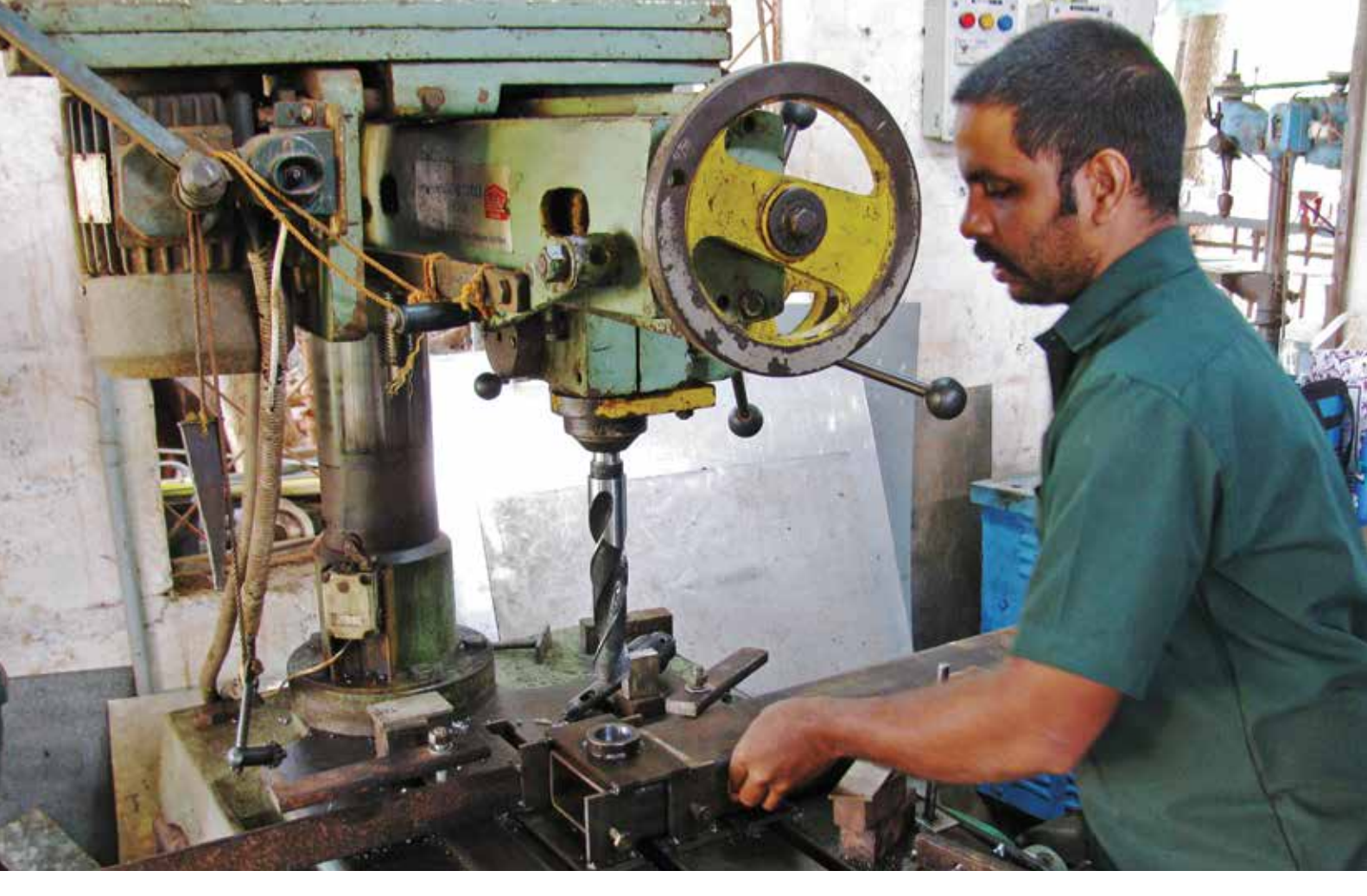
In the Matrimandir Metal workshop work is underway to fabricate the Lift which will be installed in the underground room on the west of the amphitheater to lift heavier garden tools like wheel barrows and lawn mowers from this storage area. This Lift is a key feature of this "Tools Center" which is now under construction. Below, the positioning of walls and electricity lines are marked on the floor of the Tools Center as a first step in developing this underground space.