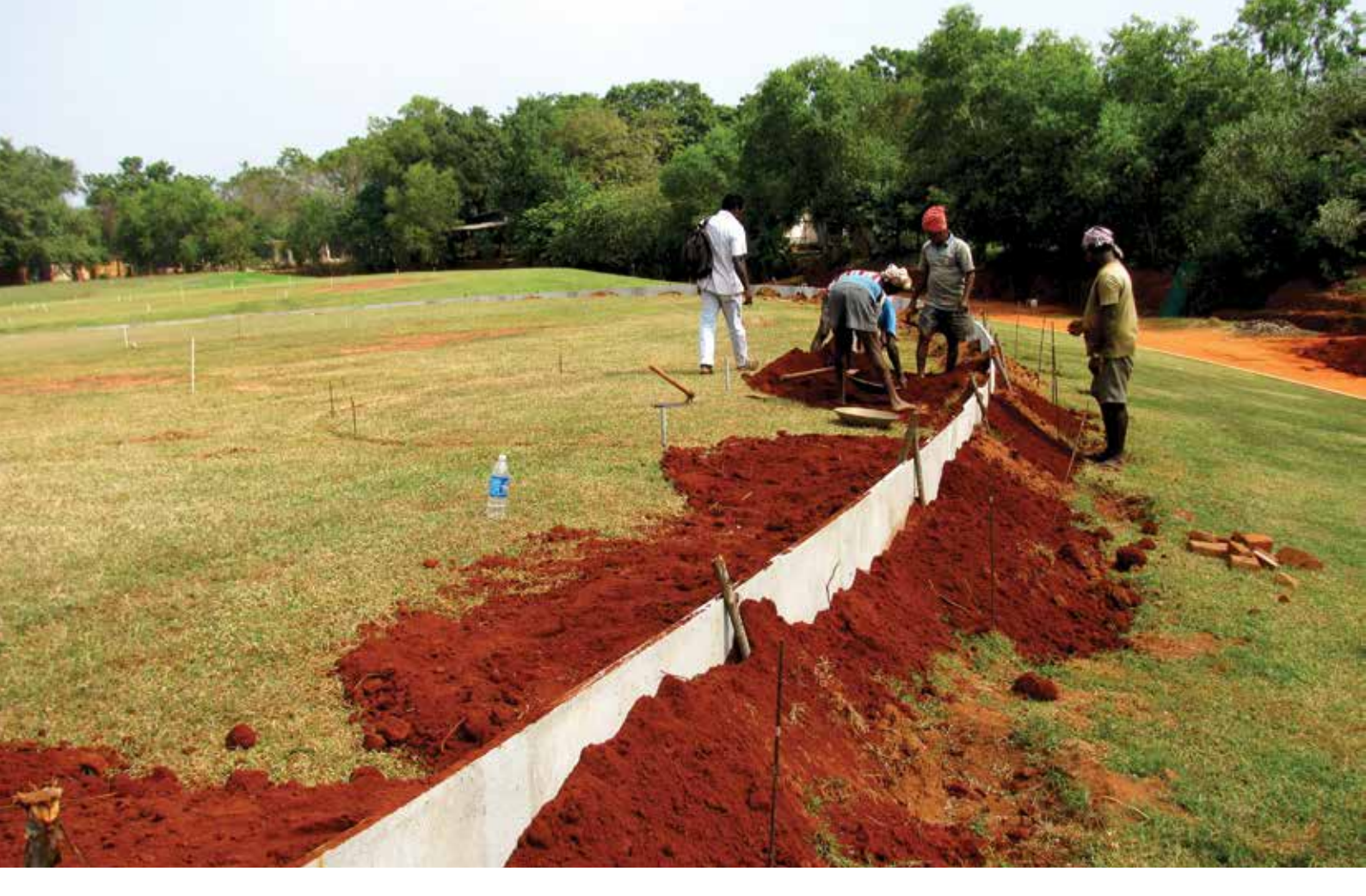
In the Garden of Youth the "Crest" of the garden is established with a band of buried ferrocement panels. It is within the area enclosed by this wide band that the elements of the garden itself, plants, pools, etc will be established. Below, members of the gardens design team work on the designs of the gardens of Wealth, Utility and Progress.