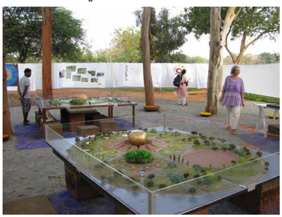
The Garden Exhibition space set up near the Matrimandir office.

Opening on Auroville's birthday, February 28th, the outdoor exhibition of these models and information panels was kept open for the next five weeks under the trees and a pleasant sunshade close to the Matrimandir office. Many people, both quests and Aurovilians came to inspect the models and offer their comments. The models, of course, give just a general view, a rough picture, of how