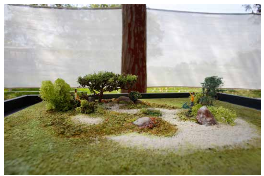
A model of a detail of the garden of Youth.

On March 31st, a slide presentation of the proposal was made to a community gathering in the Cinema