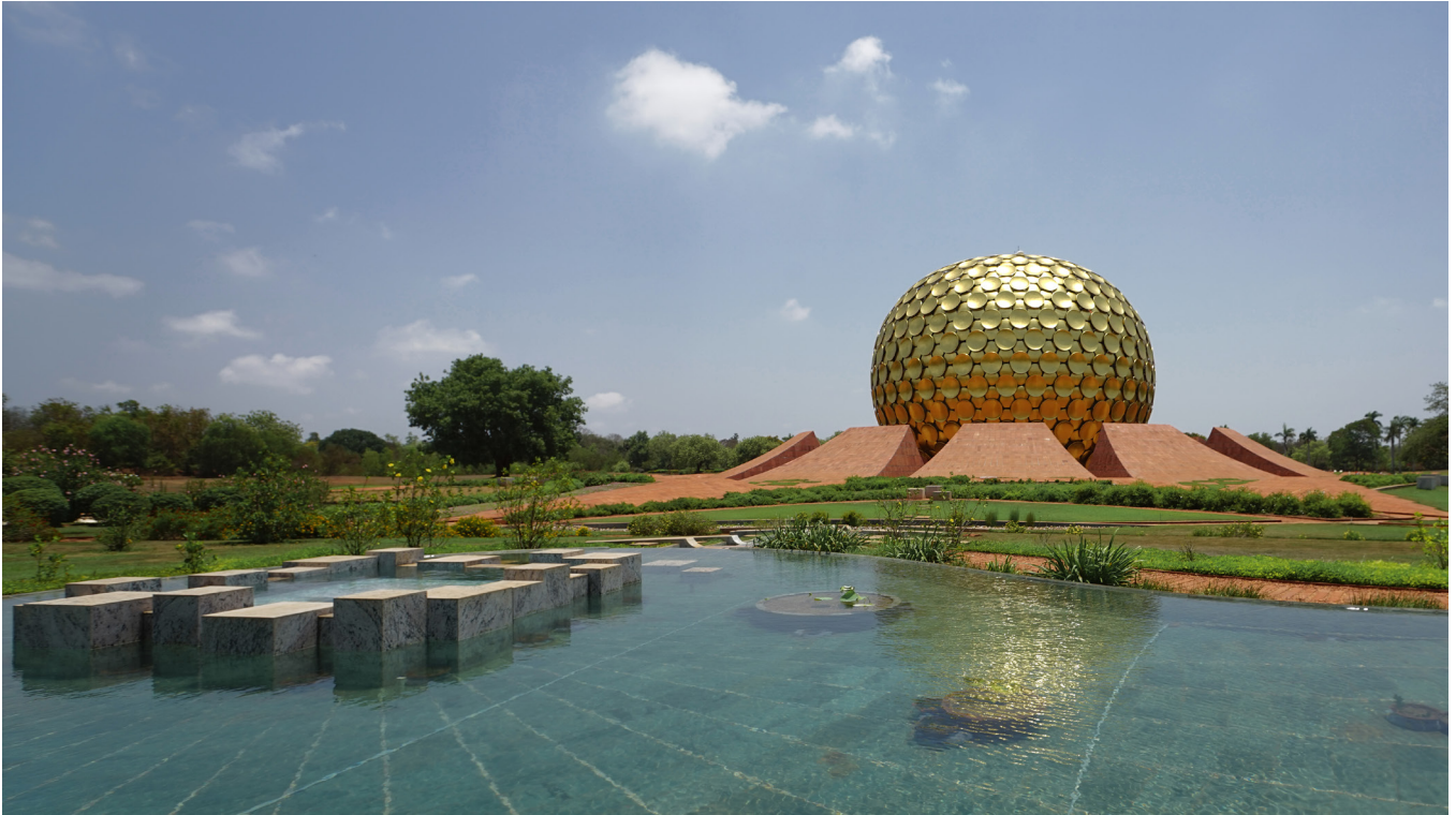
The Pond in the Garden of Consciousness, with its re-circulating cascade, was filled on April 21st