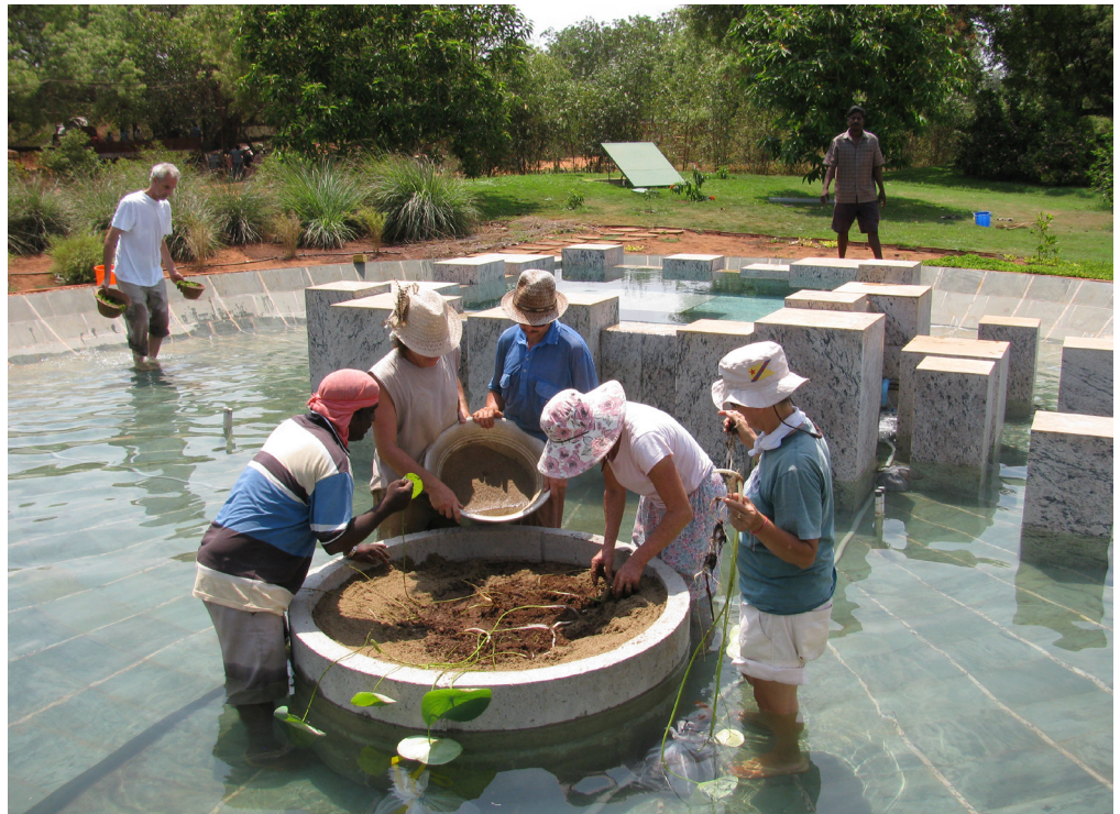
Planting a White Lotus in the Garden of Consciousness as the pool is being filled on April 21st.

All these works described above lie ahead of us in the future. Some aspects, like the planning for the nine gardens, or the trying out of path lighting techniques have begun already today and will continue for some time. Other aspects, like the building of the mini test ponds, or the creation of the new composting area are waiting just at the door, ready to begin. And still others, like the building of the remaining nine gardens, the building of the full oval road around the gardens or the completion of the spaces beneath the Amphitheater will be taken up progressively over the next four year period. The final moving of all the remaining workshops away from their positions near the gardens and the building of the Reception Pavilion are perhaps even a little further off, -Auroville does not yet own the land where this Reception pavilion has to be built, for example. But all these projects lie surely ahead, and will occupy the Matrimandir team for some years to come.