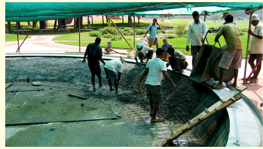
Final concreting in the pool in the Garden of Unity on November 12th

Another work going on in our metal workshop is the preparation of the aluminum stands needed for the new panels soon to come for the expansion of our Solar Plant. Since 1997 we have been fortunate to have on site a 36 KW solar plant, with over 400 PV panels used to harvest the energy of the sun. This plant is being used today to power the main air conditioning system of Matrimandir's Inner Chamber. Now this plant is being expanded, with another 15 kW of peak power being added.