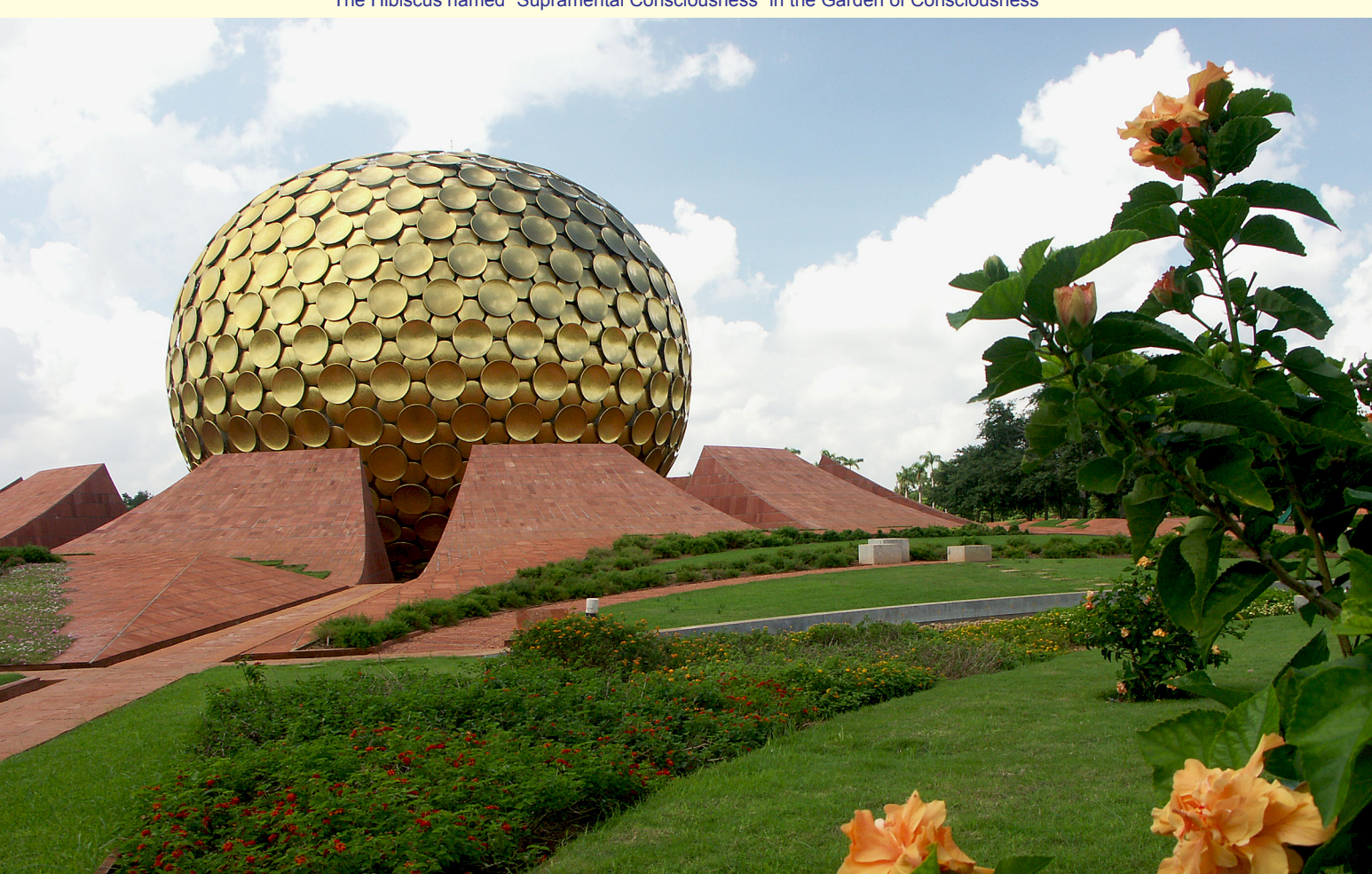
The Hibiscus named "Supramental Consciousness" in the Garden of Consciousness

Aside from planting in the gardens, work is also ongoing to lay down the red sandstone cladding of the pathway the leads up to and around the wide tear drop shaped pool. And, in the coming months, the main work remaining here will be to construct a special underground chamber which will house the pumps needed to feed the fountain and cascade which are a main feature of this garden. This underground space will also centralize the electric controls for the entire set of lights for this and for the two adjacent gardens; Existence and Bliss.