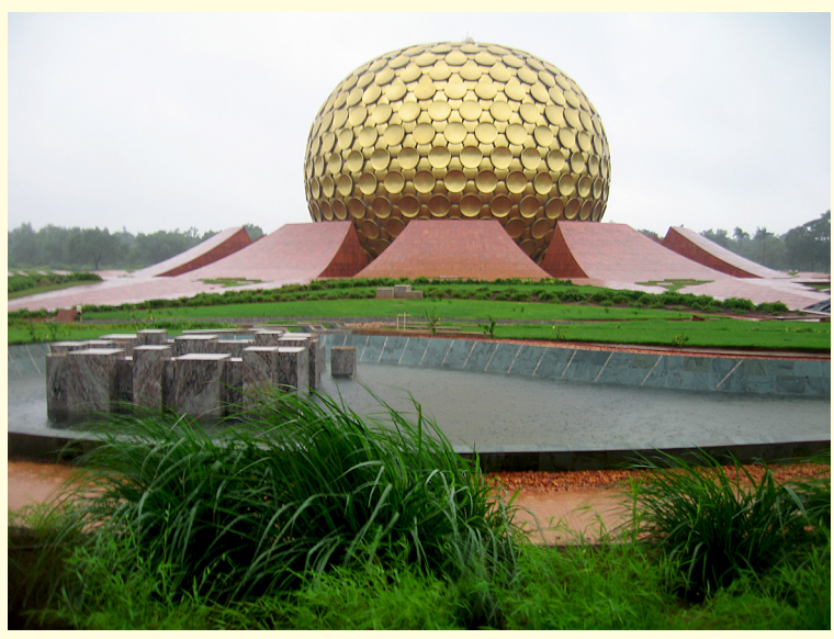
Monsoon rains lash the Matrimandir site in late October.

Now the rains come, brought in on a strong gust of wind...the strength of the gusts increases and the cyclone, still some hundreds of kilometers southeast of us, moves gradually closer. Sheets of wind-driven rain fly across the open site of Matrimandir... The trees toss their heads more and more wildly as the strength of the wind increases....there is the sound of water splashing down from the roofs that shelter us during the rain. The gutters beside the radial paths of the gardens fill with water, and flow rapidly outward to the edge of the gardens... the two large excavations there begin to fill up, two meters deep now, as the storm waters accumulate.