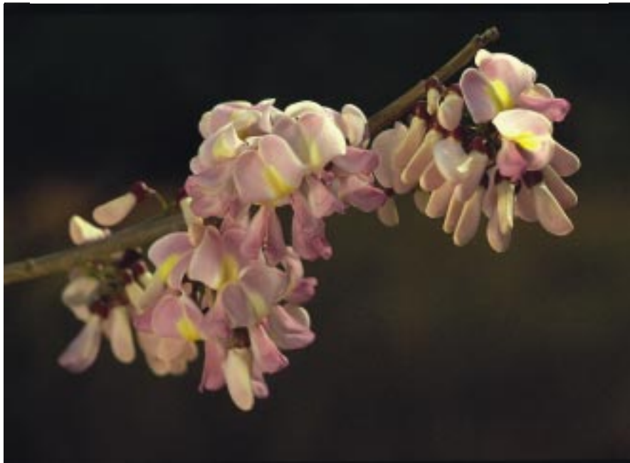
Refinement of Habits

"...if you want to have the sense of beauty in itself ... you must have a universal consciousness ... to know true beauty independent of all form, one must rise above all form. And once you have known it beyond every form, you can recognise it in any form whatsoever." 26