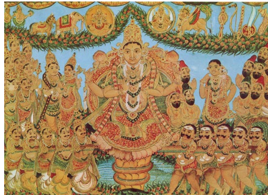
Lakshmi - Tanjore painting

that it is also a true and beautiful life. Neither the life nor the body exist for their own sake, but as vehicle and instrument of a good higher than their own. They must be subordinated to the superior needs of the mental being, chastened and purified by a greater law of truth, good and beauty before they can take their proper place in the integrality of human perfection. Therefore in a commercial age with its ideal, vulgar and barbarous, of success, vitalistic satisfaction, productiveness and possession the soul of man may linger a while for certain gains and experiences, but cannot permanently rest. If it persisted too long, Life would become clogged and perish of its own plethora or burst in its straining to a gross expansion. Like the too massive Titan it will collapse by its own mass, mole ruet sua. 28