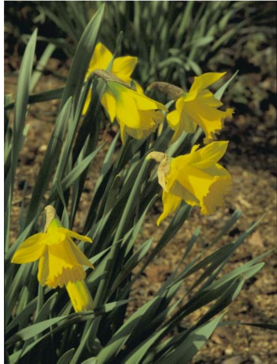
Power of Beauty

In the embodied Divine it is this aspect more than any other whom we expect to meet. Those beings who have walked the earth and who have been accepted or recognized as manifest Divinities, have most materialized an experience of this entrancing Ananda for a yearning humanity.