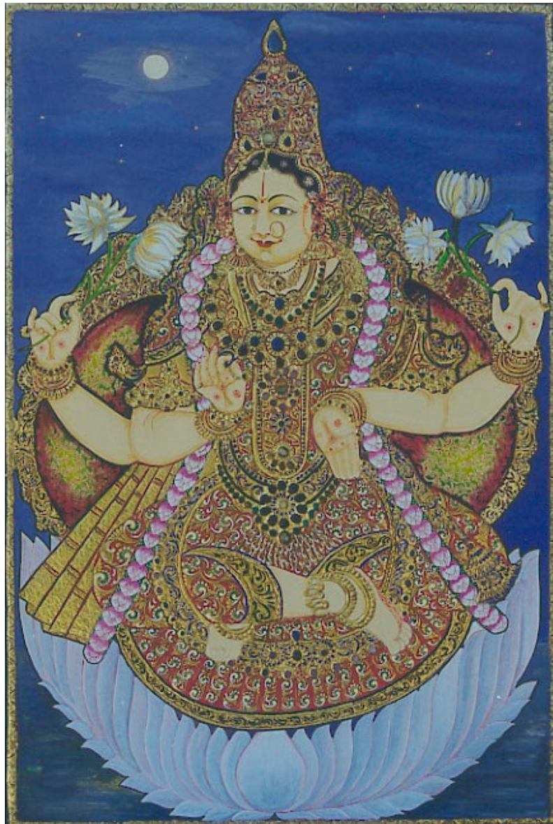
Lakshmi - Tanjore painting