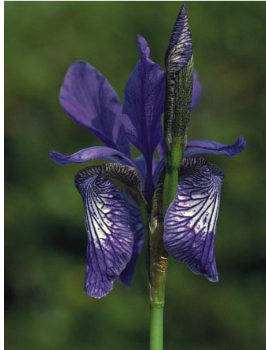
Aristocracy of Beauty