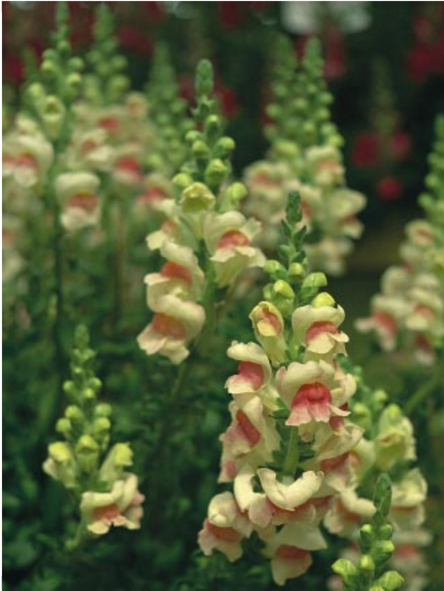
Power of Expression

Is it possible for the gentle goddess to manifest in such a world? Can the harmonies of Mahalakshmi find a small corner where the higher laws of Beauty and Delight find precedence? Auroville is meant to be such a place, and will not find itself as long as it does not wholeheartedly recognise that it cannot mix the values of a utilitarian age and yet be a welcoming home for Beauty to stay. Auroville's physical environment already manifests beauty at a touch. Its human psychological domains will express Her splendour when there is a greater conscious adherence within the collectivity to beauty, harmony and unity.