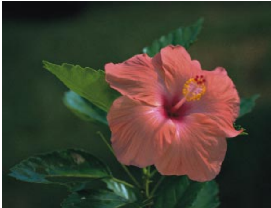
Beauty of Supramental Love (Flower of Auroville)

Sri Aurobindo’s supramental yoga is based upon the Upanishadic truth which he formulates thus in The Life Divine : “Delight is existence, Delight is the secret of creation, Delight is the root of birth, Delight is the cause of remaining in existence, Delight is the end of birth and that into which creation ceases.” 8