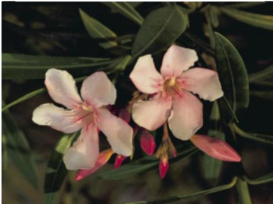
Sweetness of Thoughts turned Exclusively towards the Divine