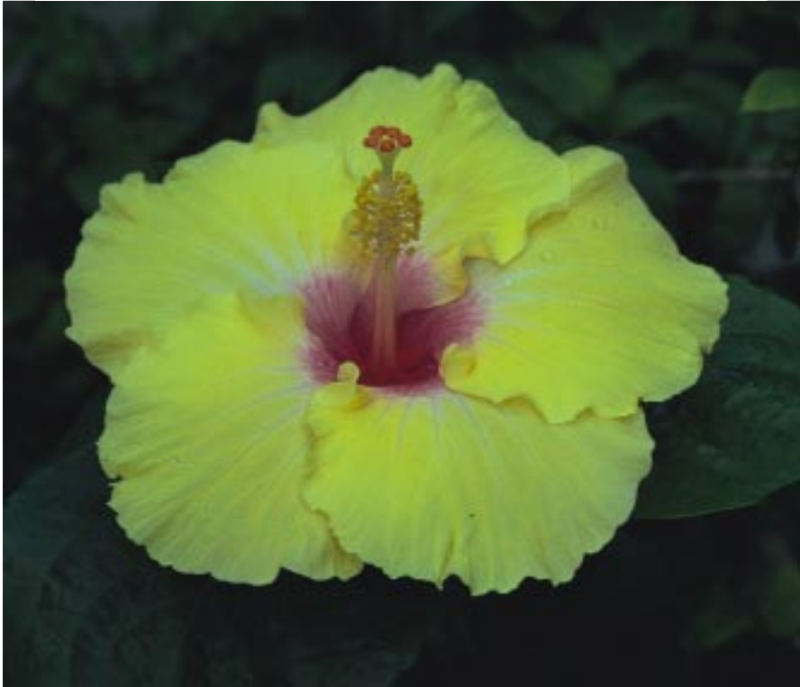
Power of Harmony

Mahalakshmi come if the sordidness remains, if one never cures the crookedness? The seeker is left wondering at such questions. The Goddess power who smites awake, with sharp pain when necessary, is Mahakali, and given the world's disharmonious state, it has been necessarily her forces that have acted most. Mahalakshmi works quite differently, she is Grace itself in action, she never insists but she may intervene in her compassion to mitigate the strict consequences of our actions. If we would but consciously consent to her demands for manifesting only beauty, harmony and love in ourselves she could absorb all the horrors of our lower nature and fill us with her divine harmonies. And the world would be unexpectedly transformed!