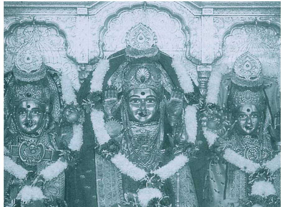
Mahasaraswati, Mahalakshmi, Mahakali - Mahalakshmi Temple, Mumbai

In India the three Goddesses – Mahalakshmi, Mahakali and Mahasaraswati are commonly invoked. Temples to each or to a combination of the three dot the subcontinent. And yet there is a debasing, a corruption in what they represent in the popular mind. The goddess Lakshmi, who embodies abundance, richness and plenty, is excessively linked in men's minds to the money-power and often invoked for this reason alone. But indeed, the wealth of Mahalakshmi is a very different thing. Her wealth is the glad harmony of many qualities, her abundance a rich generosity of nature and a sweet gracefulness of spirit. All that is gross and sordid and vulgar repels her advent.