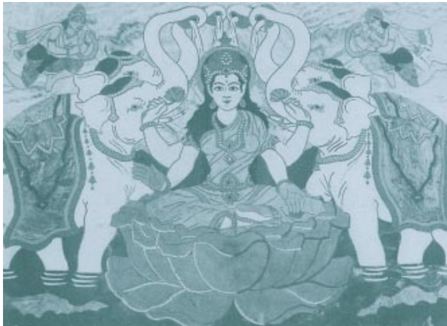
Lakshmi - Batik print

“Ascetic bareness and harshness are not pleasing to her nor the suppression of the heart’s deeper emotions and the rigid repression of the soul’s and the life’s parts of beauty. For it is through love and beauty that she lays on men the yoke of the Divine. Life is turned in her supreme creations into a rich work of celestial art and all existence into a poem of sacred delight; the world’s riches are brought together and concerted for a supreme order and even the simplest and commonest things are made wonderful by her intuition of unity and the breath of her spirit. Admitted to the heart she lifts wisdom to pinnacles of wonder and reveals to it the mystic secrets of the ecstasy that surpasses all knowledge, meets devotion with the passionate attraction of the Divine, teaches to strength and force the rhythm that keeps the might of their acts harmonious and in measure and casts on perfection the charm that makes it endure for ever.” 4