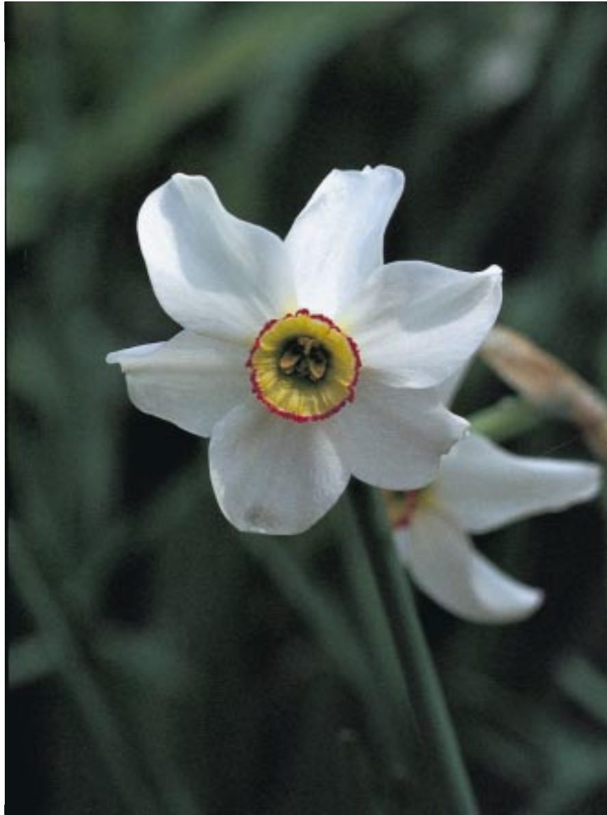
Beauty aspiring for the Supramental Realization