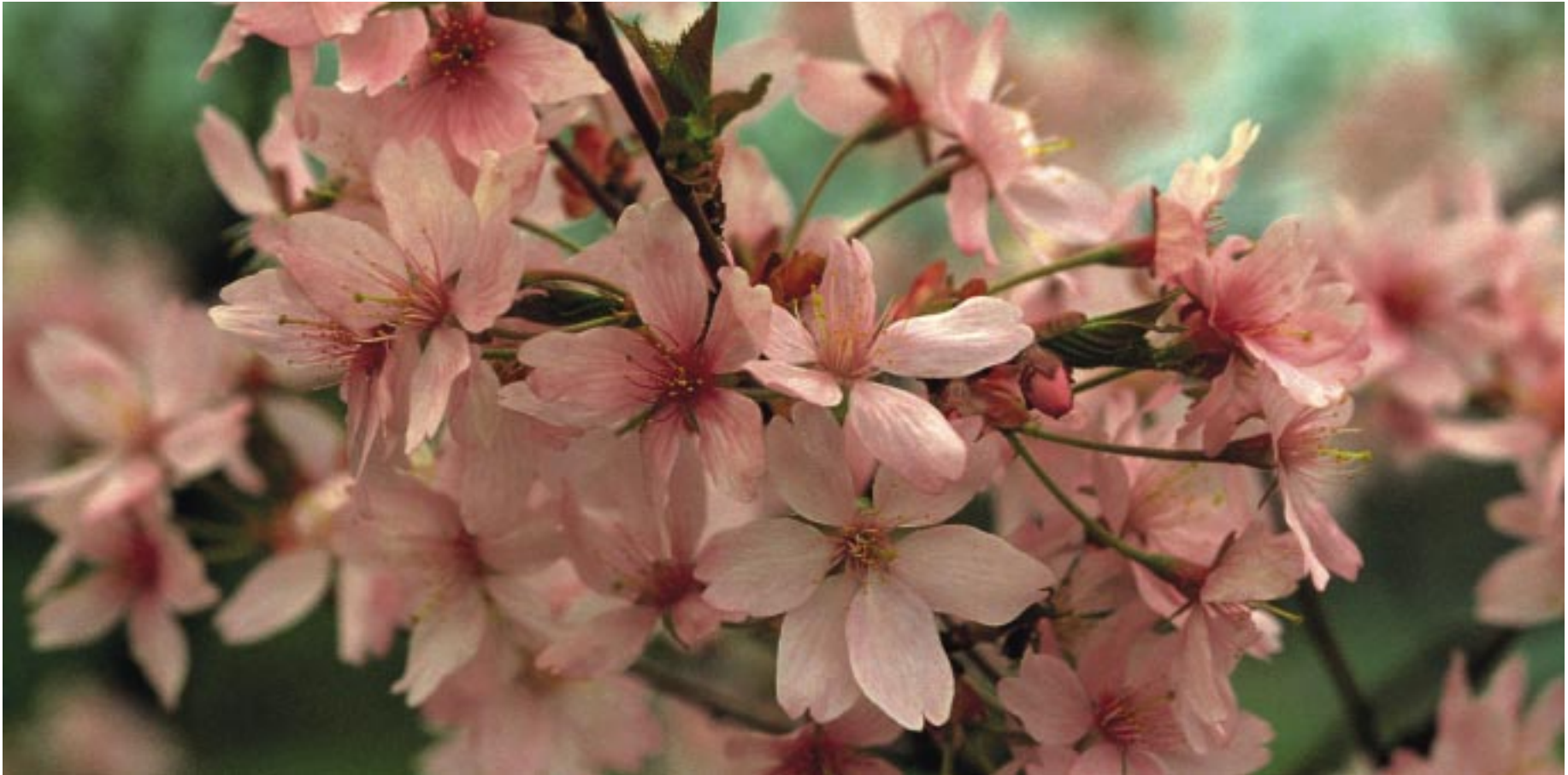
Smile of Beauty