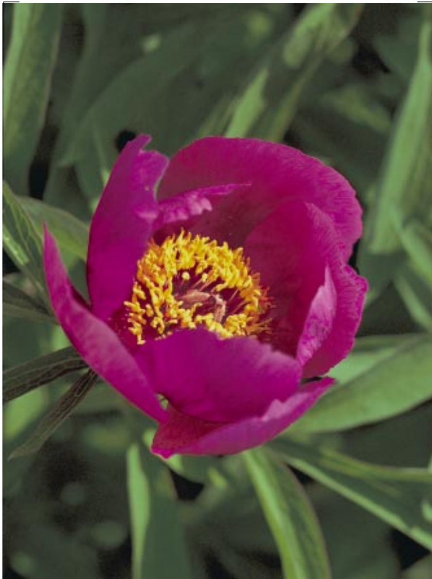
Beauty in Art