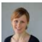
Author: Sara Burrows

“Auroville is a place where this new way of living is being worked out; it is a center of accelerated evolution, where humanity must begin to change the world through the power of the inner spirit.” ~ Mira Alafassa, “The Mother” of Auroville