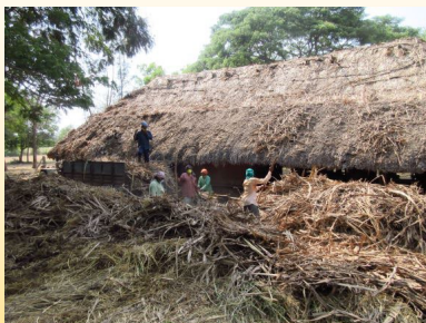
Taking down the thatch roof

The renewing of the cow house roof, step by step: