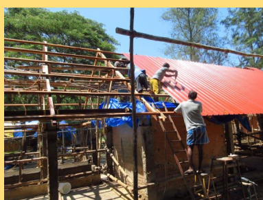
Adding the roof sheets