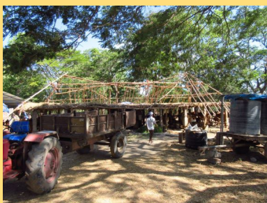
Taking down the wood structure