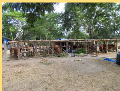
without roof structure