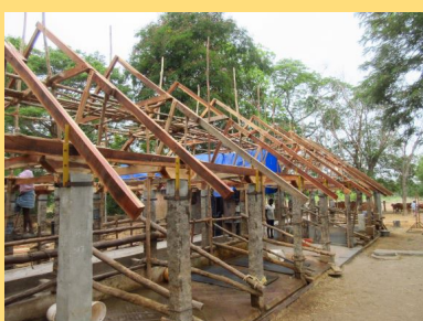
carpentry work for the new structure