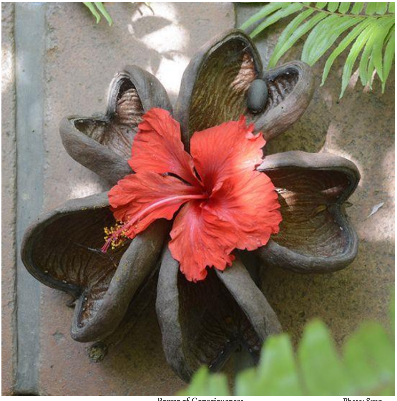
Power of Consciousness

A weekly bulletin for residents of Auroville 5th September 2020