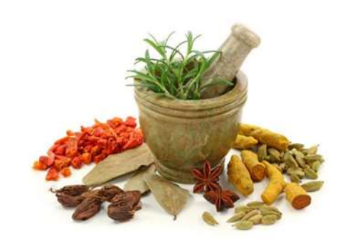
"Nature is the all-round Healer." (Collected Works of the Mother, talk of 30/06/1965)