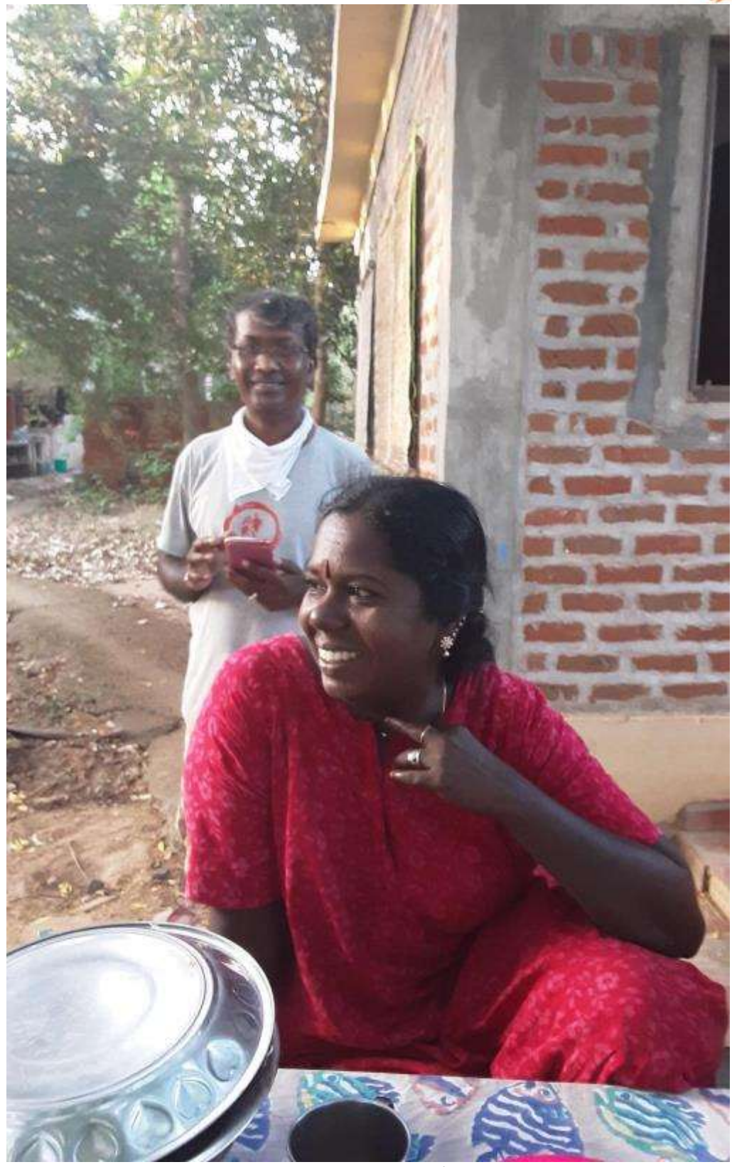
Thank you all for your support and trust in our project. Let us prosper together in harmony with nature.