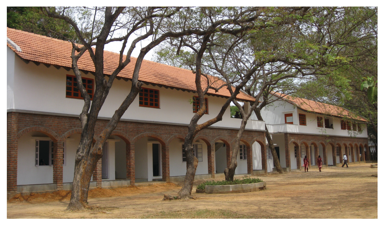
"No, there will be a primary class problem for the whole population... for Auroville. And that will be an interesting problem: how can we prepare the children, children taken from anywhere, who have no way of learning at home, whose parents are ignorant, who have no possibility of having any means to learn, nothing, nothing but the raw material, like that – how can we teach them to live? That will be an interesting problem."

The Mother - Mother's Centenary Edition, Vol. 12