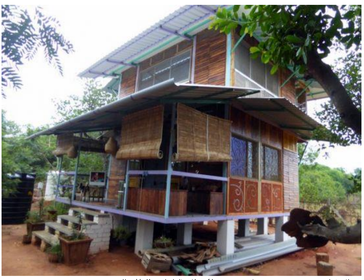
Movable House in Anitya (Joy of Impermanence)

A weekly bulletin for residents of Auroville 10th October 2020