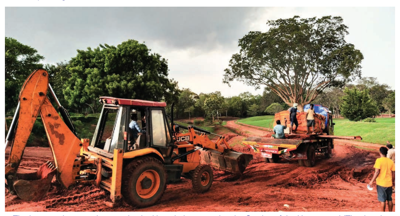
The iron wood tree on the open backed lorry being moved to the Garden of the Unexpected (The thunder storm struck just after this photo was taken)

It took three tries before we were able to successfully lift the nine ton weight of the tree,- first a week earlier with one crane, then with two cranes working in tandem, but the weight was too much and too awkward to handle. Finally we came upon the idea to lower the road level just beside the tree, so that it could be simply pulled sideways, by two JCB's working together, onto the waiting bed of the lorry. This was quite a dramatic sequence of events in itself! To top it off, the final successful move was accompanied by the arrival of a big thunder storm. We had watched the heavy gray clouds and sheets of rain approaching as the tree was being loaded on the lorry, hoping that we would still have the few minutes needed to get this done, and get the lorry out of the low spot before the expected flooding. We had just managed to move about a hundred meters along the road when the storm struck. All vehicles soon were stuck in the mud created by the dramatic rain, - two JCBs, a crane and the lorry. Everyone involved in the operation was soaked to the skin under the thunder and lightning