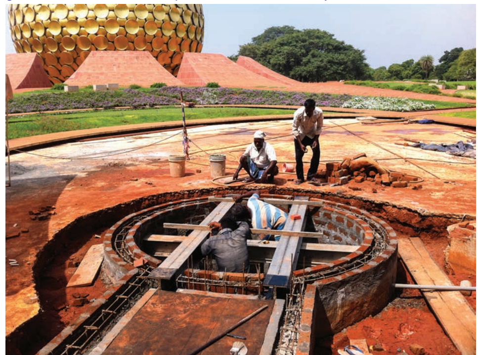
The concrete foundation for the crystal group in the garden of Existence being completed in October.

As mentioned above, the large central stone in this garden was lifted from its spot in order to make way