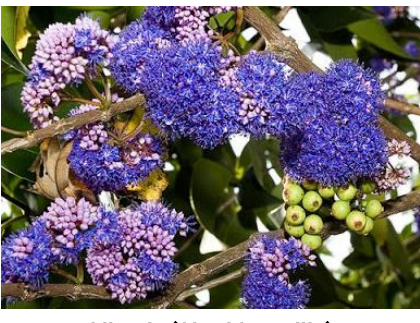
Miracle (Air of Auroville) Memecylon Tinctorium (Ironwood) Marvellous, strange, unexpected.

Breathe The air of Auroville A living miracle