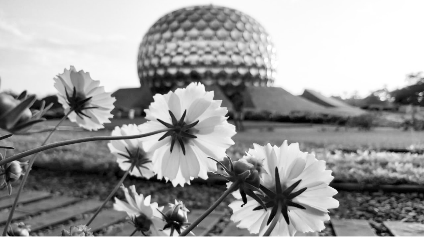
#877 A weekly bulletin for residents of Auroville 3th July 2021