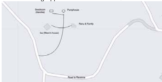
Site plan showing Mango Field residential area