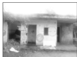
The existing structure