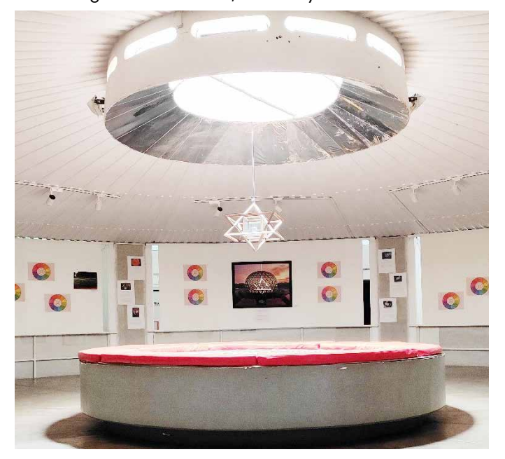
NN 884 - 21 August 2021

Date: Sunday 5 September 3:30 – 4:30pm Facilitator: Aravinda No registration needed, voluntary contribution