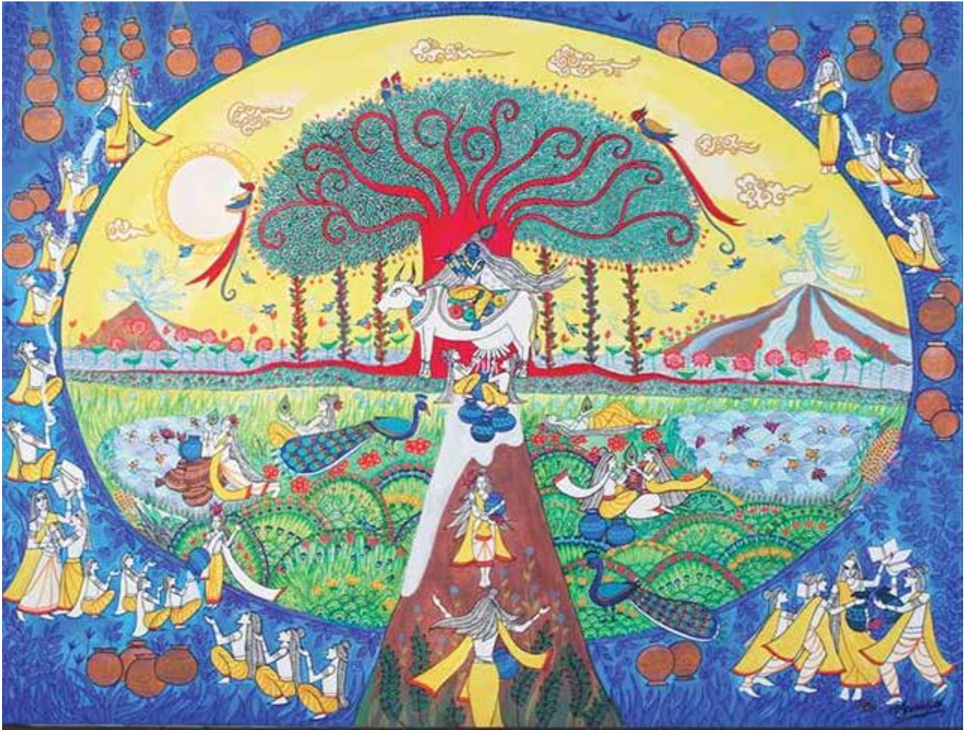
Painting by Aparajita Bara

#886 A weekly bulletin for residents of Auroville 4 September 2021