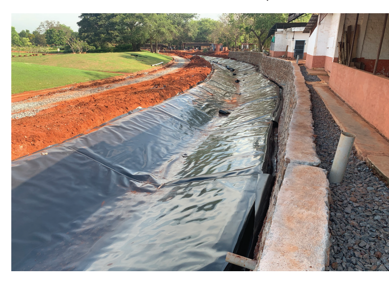
The V shaped channel was covered with a waterproofing layer.