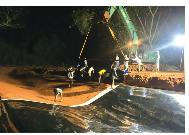
The laying of the liner took place at night, taking advantage of the cooler air to get the highest quality of welding on the joints.

to be negotiated.... Many trees had grown up on their own over the decades of the construction of the Matrimandir, and others had been planted during different stages of the outer gardens development. All available techniques were used to find ways to lead the Water Channel around the rim of the gardens. Some very special trees were transplanted. Other larger trees which had grown to some statuesque beauty were preserved by winding the channel between them, or narrowing the channel to slide by. One tree was distinguished by having a granite wall built half around it to separate it from the path of the channel (see photo). And, finally, several trees, being judged to be simply too much in the way, or too difficult to protect, were