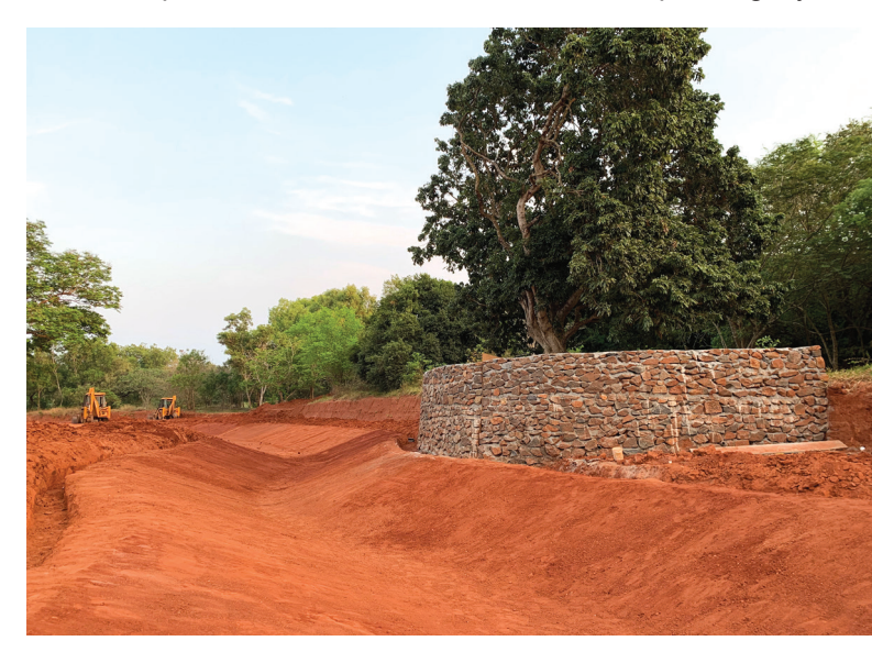
A particularly beautiful tree is now protected by its own granite wall.