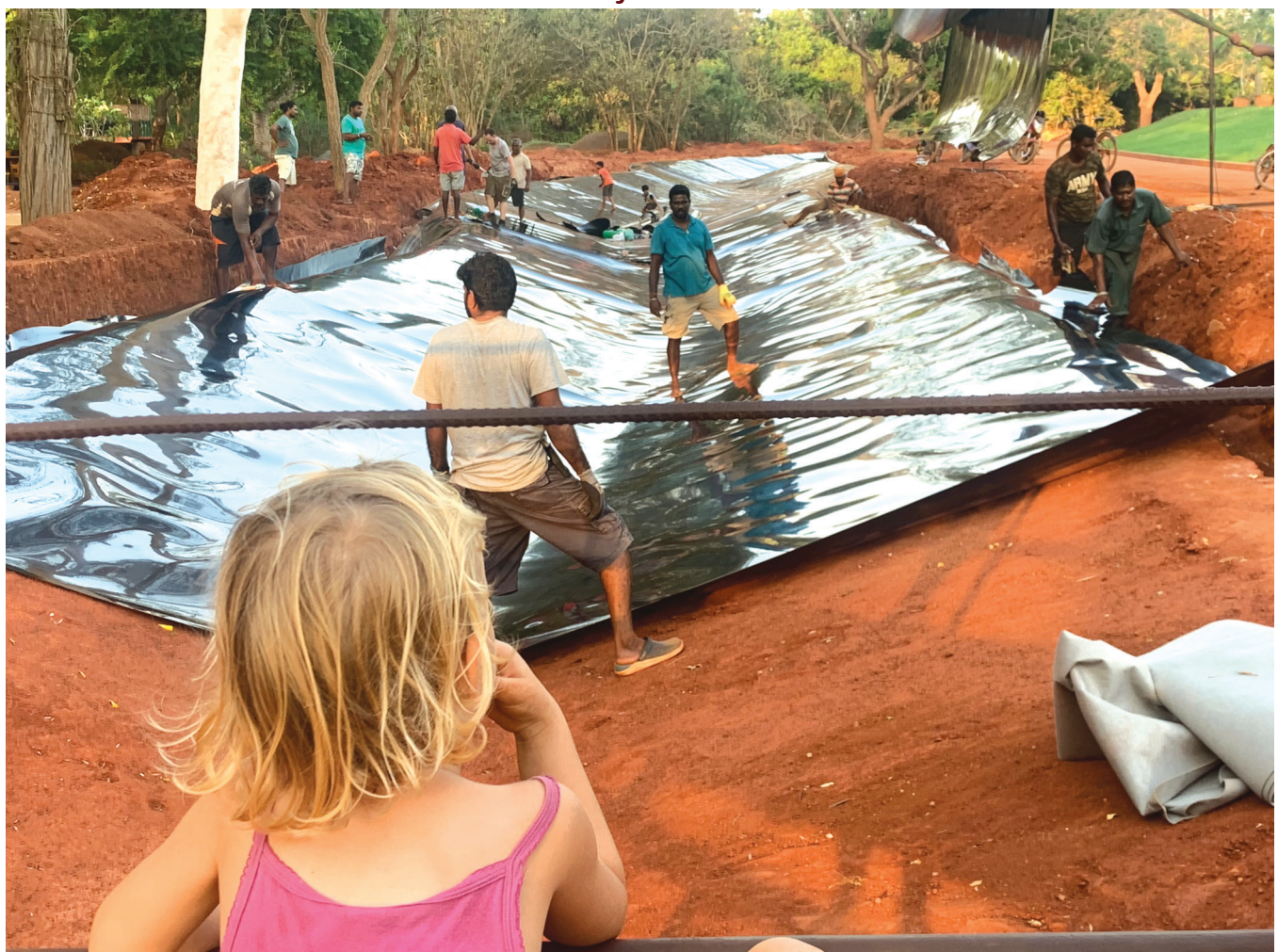
A young spectator watches from a temporary construction bridge as the water proofing liner is laid in the Open Water Channel which encircles the Matrimandir gardens.