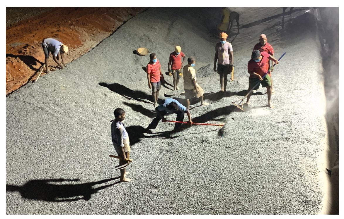
As a final step in the process, the HDPE line is covered with a 20 cm layer of granite chips to protect it from chances of puncturing and from the effects of UV radiation.

and Power near the Banyan tree and two large sections of the garden of the Unexpected. The goal is to have all these four areas completed by August 15<sup>th</sup> this year.