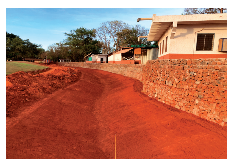
The V shaped water channel follows the newly built granite stone wall close to the Matrimandir workshops.

Then there was the ground reality of existing trees