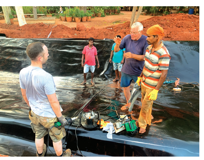
The joint welding team discusses the job.

While this intensive activity was under way on the water channel, work is also underway to bring to completion the construction of the gardens of Life